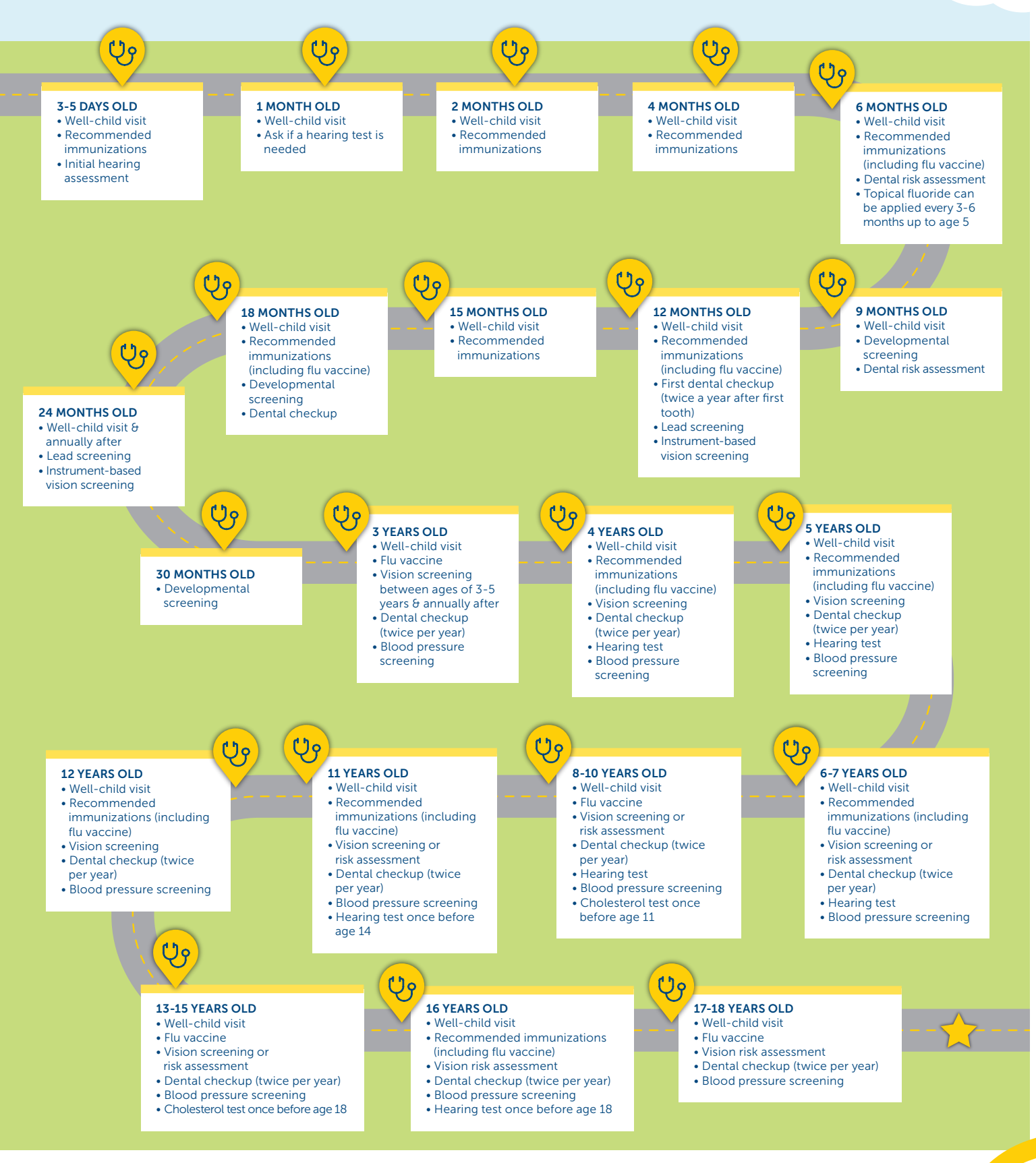
Wellness guidelines provided by Bright Futures, a national health promotion and prevention initiative, led by the American Academy of Pediatrics. Based on the needs of your child, the physician may adjust these recommendations.

As your baby grows, he or she will visit the doctor for well care and recommended immunizations. The wellness roadmap below will help guide you on any age-based well care needed as your child grows.