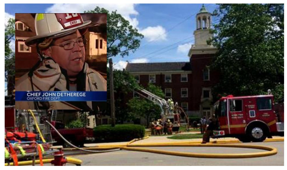
Oxford Fire Department, Oxford, Ohio