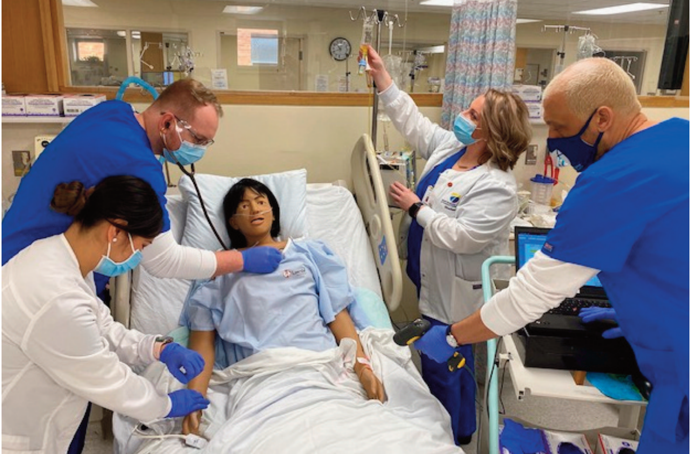
GSC nursing students in Simulation Center