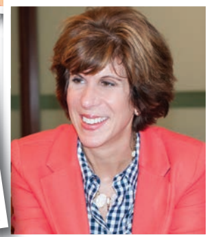
Godmother to our Daughter

cancers and treatments such as head and neck cancers, high-risk breast cancer, molecular tumors, and genomics, TCI is not stopping there. There is a groundbreaking opportunity in front of us, and you can make a difference.