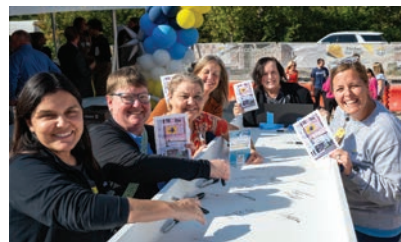
GSH team members signing a beam set to lay at the foundation of the new West Tower