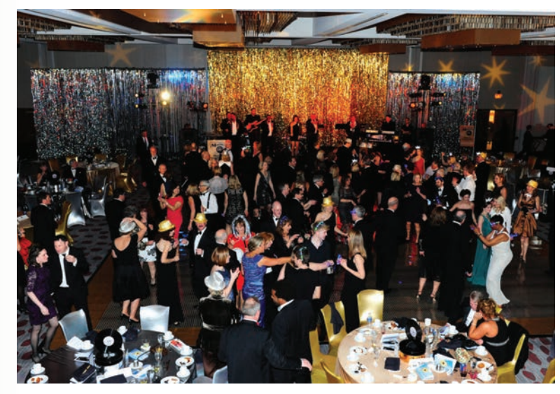
2015 Gala | page 7

If you do not wish to receive future issue of Compassionate Giving magazine or any other future fundraising communications from Good Samaritan Hospital Foundation, you may opt-out of future communications. You may call 513-862-3786 to opt out.