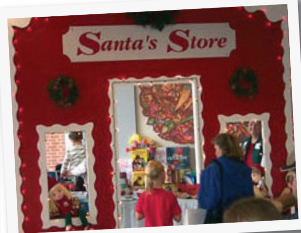
Children of TriHealth employees enjoyed Santa's Store at the Christmas party