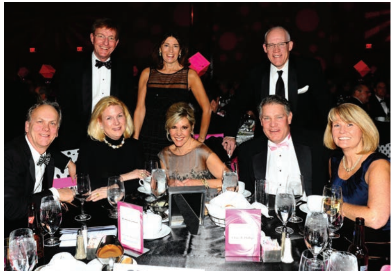
30th Annual Gala | page 7

If you do not wish to receive future issue of Compassionate Giving magazine or any other future fundraising communications from Good Samaritan Hospital Foundation, you may opt-out of future communications. You may call 513-862-3786 to opt out.