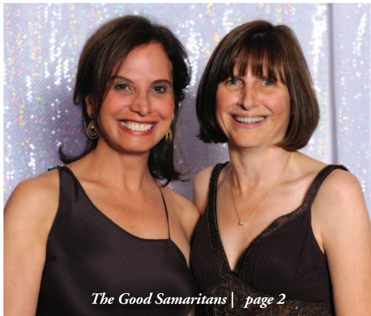
The Good Samaritans | page 2

If you do not wish to receive future issue of Compassionate Giving magazine or any other future fundraising communications from Good Samaritan Hospital Foundation, you may opt-out of future communications. Please send a letter to Good Samaritan Hospital Foundation, 375 Dixmyth Avenue, Cincinnati, Ohio 45220. In your letter, please state that you do not wish to receive any future fundraising communications from Good Samaritan Hospital Foundation. You may also call 513.862.3786 to opt out.