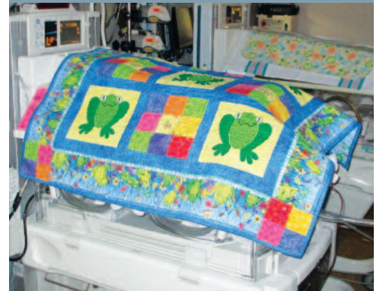
Sample of a quilt for Newborn Intensive Care Unit.

If you are interested in learning more about becoming a member of the Good Samaritan Hospital Guild, please contact Good Samaritan Hospital Foundation at 513.862.1258.