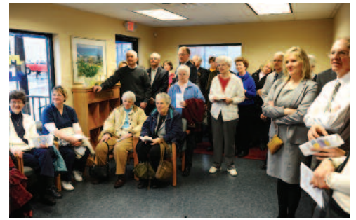
Donors and volunteers attend the dedication.